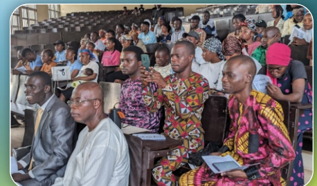
AFCF FEDPOLY, OFFA 2025 NRP