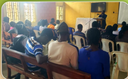
AFCF FUNAAB 2025 NRP