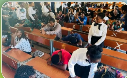
AFCF FUOYE CAMPUS 2025 NRP