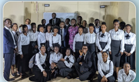
AFCF FEDPOLY, OFFA 2025 NRP