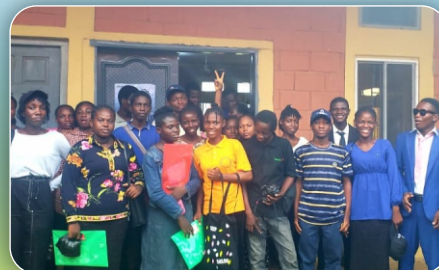
AFCF FUNAAB 2025 NRP