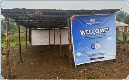
AFCF FUOYE CAMPUS NEW LAND