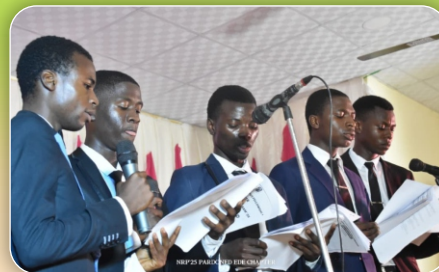
AFCF FEDPOLY, EDE 2025 NRP