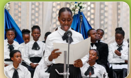
AFCF UI 2025 NRP