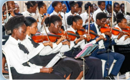
AFCF UI 2025 NRP