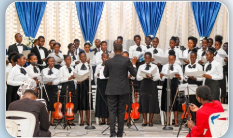
AFCF UI 2025 NRP