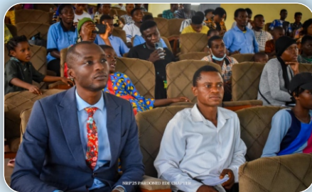
AFCF FEDPOLY, EDE 2025 NRP