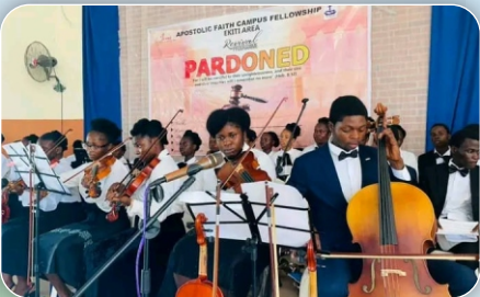
AFCF FUOYE CAMPUS 2025 NRP